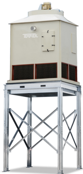
PT-135-G3 model shown on a galvanized stand.