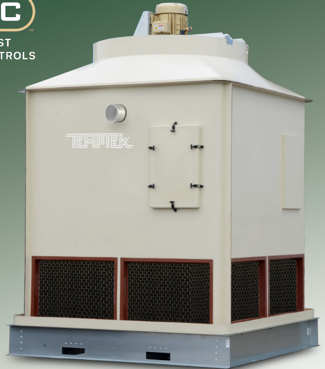
PT-135-G3 model shown.